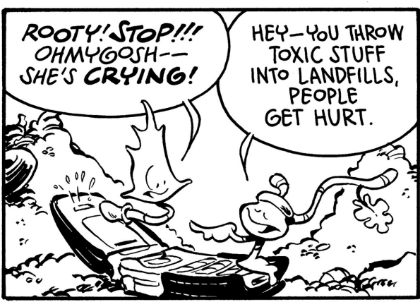
@ 2006, GO NATUR'L STUDIOS, LLC. RUSTLETHELEAF.COM